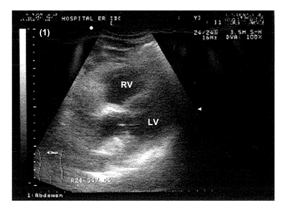
Fig. 1. Bedside ultrasound of the heart during initial resuscitation. No pericardial fluid was found. RV: right ventricle; LV: left ventricle.

Return of spontaneous circulation (ROSC) was noted within 10 minutes of compressions. A 12-lead ECG showed sinus tachycardia of 132 bpm with peaked T waves. His systolic blood pressure (SBP) was kept around 90 mm Hg by 2 L of normal saline bolus and continuous norepinephrine infusion.