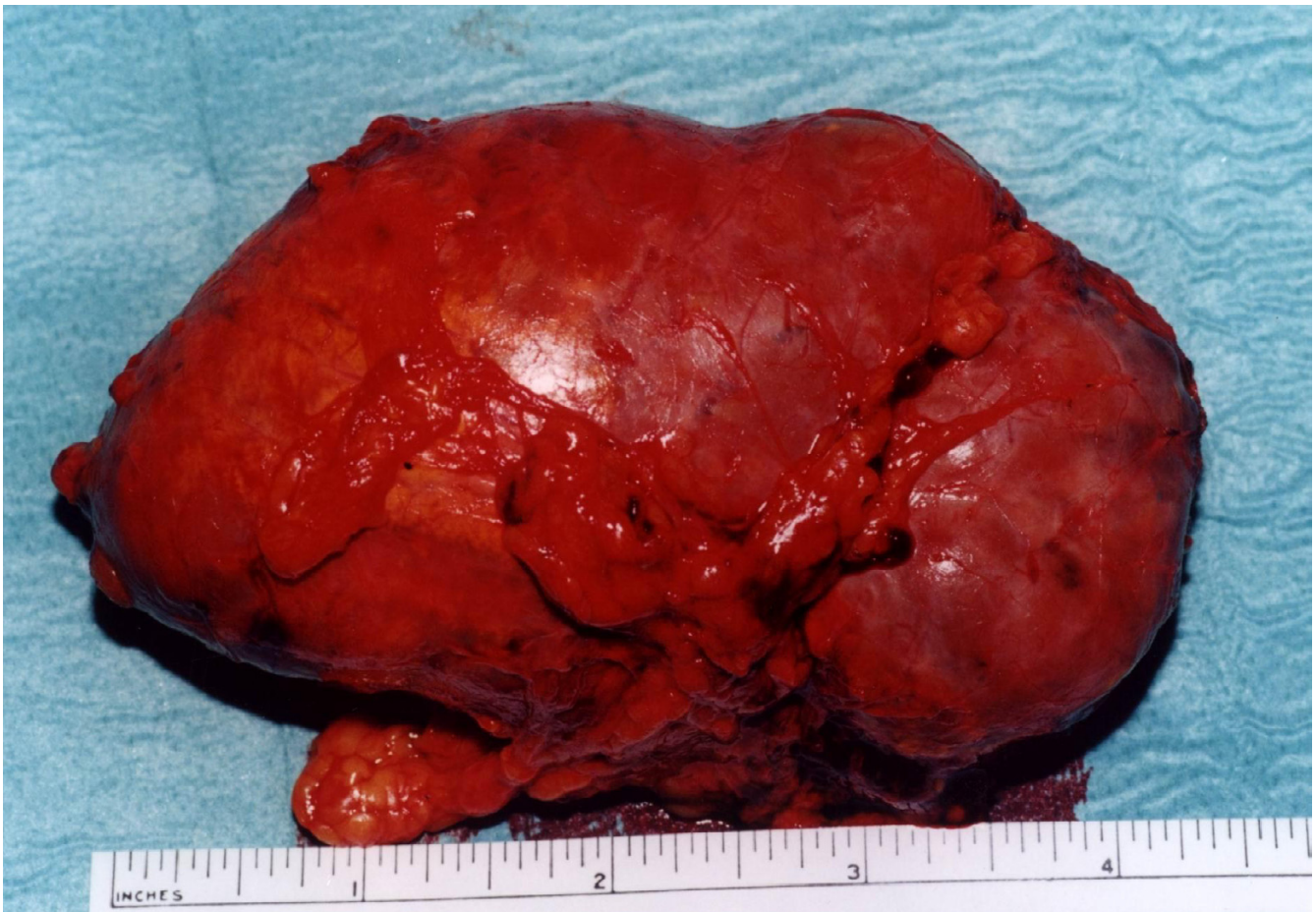
Figure 2 The resected adrenal mass was 11.5 cm by 7.5 cm in size.

stated that a complete TAE is difficult because the adrenal gland has three feeding arteries. Taniai et al [6] reported that despite the fact that adrenalectomy is the most effective way to control adrenal metastases from HCC, TAE is chosen as treatment of choice when the patients' performance status is too poor to tolerate an operation. Finally, ultrasound-guided percutaneous ethanol injection therapy (PEIT) is claimed to have technical difficulties and carry the additional risk of tumor seeding through the needle tract or bleeding from the punctured tumor [5,7]. However, Momoi et al [8] in a retrospective study of 20 patients treated for adrenal metastasis of HCC by various methods reported that PEIT shows good results for small adrenal metastasis. In our case, adrenalectomy was our first option as the patient's condition allowed an operation and the diagnosis of a primary HCC had not been established by the CT scan imaging, the serum AFP concentration and the liver function tests during the preoperative period.