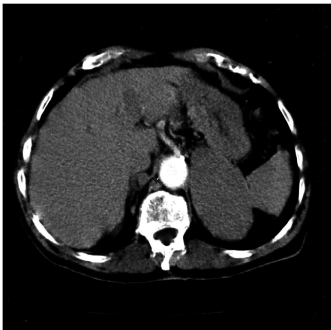
Figure 1 CT scan showing left adrenal gland tumor 10 cm in diameter, having homogenous intensity. No liver lesion is visualized.

hypertension and hepatitis B. The laboratory investigations revealed hypercalcaemia and in an abdominal ultrasound scan (US), a mass was detected in the retroperitoneal space close to the left kidney. Then a Computed Tomography (CT) scan with contrast was performed which revealed an enhancing mass, 10 cm in diameter, between the pancreas and the left kidney originating from the left adrenal gland. No other pathological findings from intra or extra-peritoneal organs were identified (Figure 1). The serum alpha-fetoprotein (AFP) concentration was 75.6 ng/ml (normal range: 0–10 ng/ml) and C19-9 concentration 37.6 ng/ml, while the liver function tests were normal.