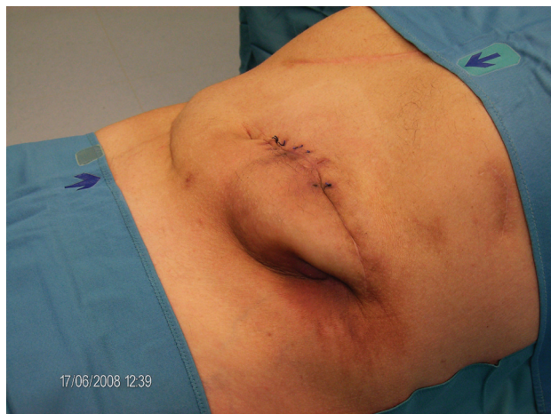
Figure 2 Subcutaneous tissue necrosis at the caudal edge of an implanted SynchroMed II pump. Skin sutures after an attempt to correct the pump placement by moving the device more medially are still visible.

Despite innovations such as electronic, programmable pumps with the potential for patient-controlled bolus application, as well as new drugs, the shortcomings in available therapy remain considerable. These shortcomings are reflected in complications related to intrathecal therapy such as catheter disconnections, spinal fluid leakage, tissue necrosis, battery exhaustion, misses of refill ports with resulting paravasates, drug incompatibilities, catheter granulomas, and seromas around the implants. These complications suggest many possibilities to further optimize intrathecal pain therapy: improving catheter connections to withstand average physical stress; designing catheters that avoid spinal fluid leakage