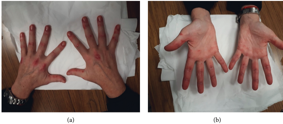
FIGURE 1: Papular erythematous lesions on both the palmar and dorsal surface of the patient's hands.