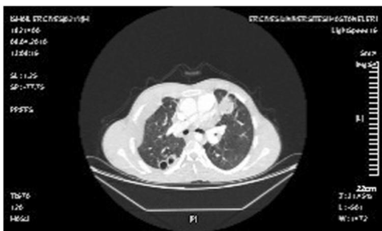
Figure 2 Computed tomographic scan of a 20-year-old male demonstrates bilateral multiple and perforated lung cysts four months after medical treatment.

tube thoracostomy, which was applied in the first thoracotomy, was maintained during the second thoracotomy.