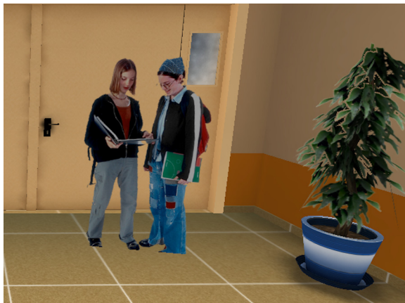
Figure 1 Screenshot from VR condition. Figure illustrates virtual environment representing an academic oral examination in a classroom.

a typical Heart Rate Variability (HRV) spectral method indexes were used to evaluate the autonomic nervous system response [35-40]. At this purpose spectral analysis was performed using Fourier spectral methods with custom software. The rhythms have been classified as very low frequency (VLF, <0.04 Hz), low frequency (LF, from 0.04 to 0.15 Hz), and high frequency (HF, from 0.15 to 0.5 Hz) oscillations. This procedure enabled us to calculate the HF index [39,40].