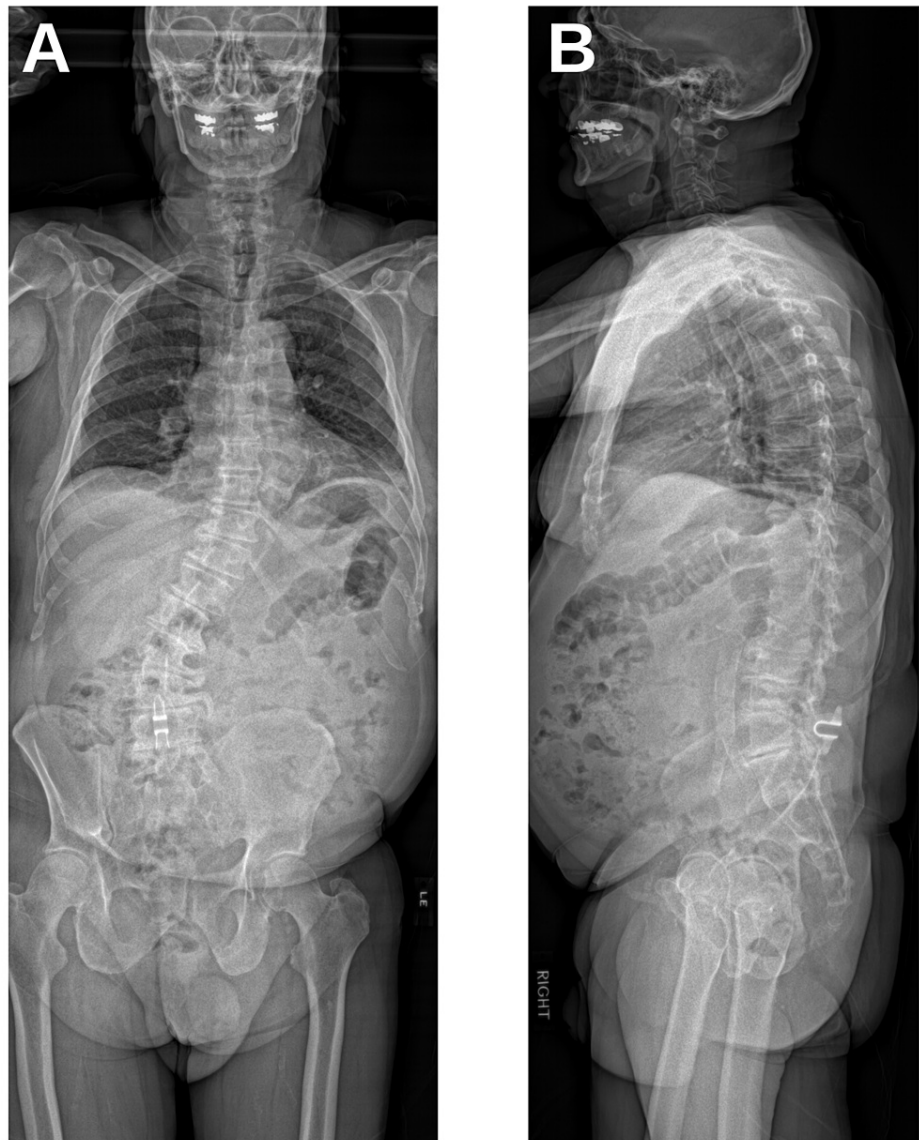
FIGURE 1: Pre-Operative Radiography

Pre-operative coronal (A) and sagittal (B) radiography showing significant scoliotic deformity.