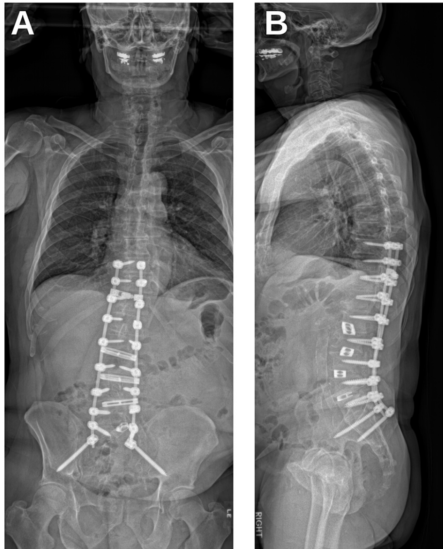
FIGURE 2: Post-Operative Radiography

Post-operative coronal (A) and sagittal (B) radiography shows instrumentation and significant correction of scoliotic deformity.