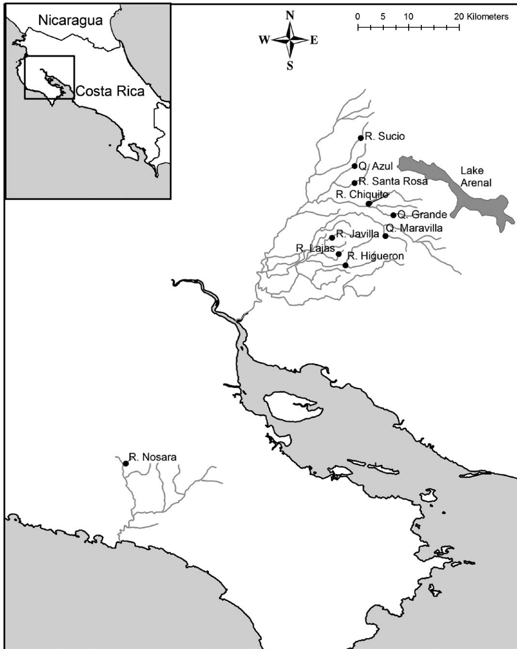
FIGURE 1 Locality map of study area. Location of ten sites in Costa Rica (four predator and six nonpredator) where fish were sampled for behavioral and morphometric analysis. Rivers Higueron, Javilla, Lajas, and Nosara were classified as predator sites given the presence of the predatorial guapote ( Parachromis dovii ) and the others as nonpredator sites. In the site names, “R.” stands for “Rio” and “Q.” stands for “Quebrada,” terms that loosely translate in English to river and stream, respectively

the stream unutilized. Mature males were identified by the presence of a fully developed gonopodium. Females greater than 22 mm (standard length [SL]) were presumed to be sexually mature (Johnson & Belk, 2001).