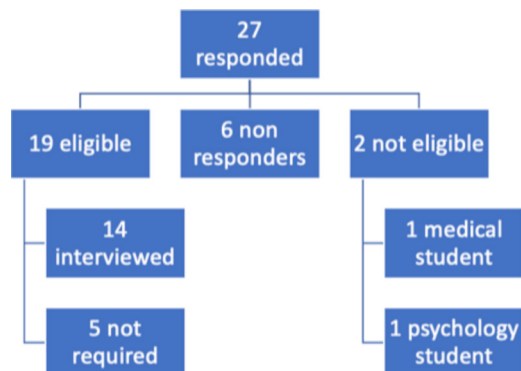
Figure 1 Participant recruitment process. Individuals who responded contacted the researcher to enquire about the study. Non-responders either did not return the eligibility questionnaire or did not confirm interest in the study. Five participants were not required as data saturation was reached.

An interview guide (online supplemental file 1) of open-ended questions informed by the relevant literature 34 41 42 was used to explore key areas of MHL, 43 including knowledge of ED symptoms, causes, characteristics, treatments and recovery, and personal help-seeking behaviours (see online supplemental file 1 for specific questions relating to these areas). These topics were chosen to reflect a broad overview of ED-MHL, to ensure participants were able to share their full knowledge and perceptions they have of EDs, ensuring the research question was answered. The interview guide ensured consistency across interviews and was piloted on participants known to the researcher who met the eligibility criteria to ensure questions were accessible to participants. Pilot data were not included in the study.