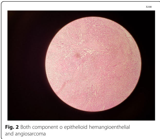
Fig. 2 Both component o epithelioid hemangioendothelial and angiosarcoma

group of tumours. It is an extremely rare vascular neoplasm of low to moderate malignancy. Based on the previous studies, the CHE may present at any age and its size ranges from 0.7–30 cm. These lesions are usually composed of circumscribed nodules, plaques, or ulcerated tumors. The risk of CHE was reported to be higher in females than males [5, 6]. It commonly occurred on the dermis or subcutaneous tissues in over half of the reported cases. However, the CHE may occur in different locations of the body. The head and neck lesions are the second-most-common sites of CHE development. In our case, the CHE was limited to the facial and scalp surface. The lesion of our study was unique since it involved all of the scalp surface, eyelids, and face and the swelling of the eyelids resulted in complete closure of the eyelids on both sides, which impaired the patient’s vision; however, the patient’s eye examination was normal. It seems that the CHE is a lesion composed of a mixture of different patterns, which can vary from tumor to tumor [7, 8]. In