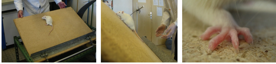
FIGURE 1: The tilting board apparatus.