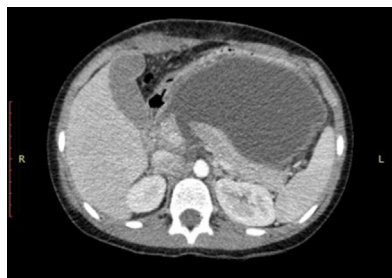
Fig. 1. Axial post-intravenous contrast-enhanced computed tomography scan shows grade IV pancreatic trauma in a 13-year-old boy with blunt abdominal trauma.