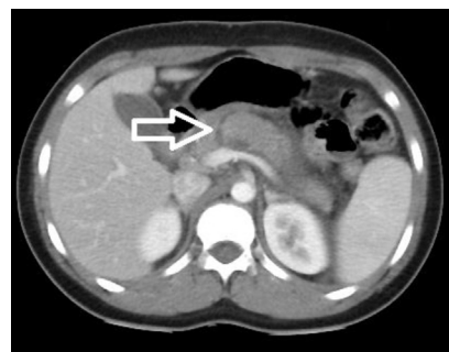
Fig. 3. Axial post-intravenous contrast-enhanced computed tomography scan, shows grade IV pancreatic trauma (white arrow) in a 13-year-old boy with blunt abdominal trauma.