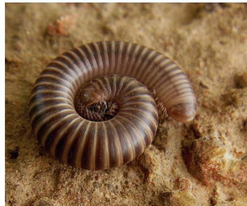
FIGURE 3: Spirostreptid millipede from Kou.

of millipede is small, they will constitute a poor source of protein. Their guts mainly contain soil and litter remains [24], but their calcified exoskeleton might constitute a considerable source of calcium, which may constitute 13–17% of the dry weight [29–31] or 9% of the fresh weight [32]. In fact, millipedes are considered an essential source of calcium for egg production in certain birds [30, 33, 34]. In this work we present data based on Tymbodesmus falcatus , one of the species eaten by the Bobo people.