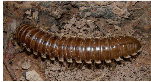
FIGURE 1: Live gomphodesmid millipede ( Tymbodesmus falcatus ) from Kou.

Until this study, the nutritional value of millipedes has never been assessed. Considering that the muscle volume