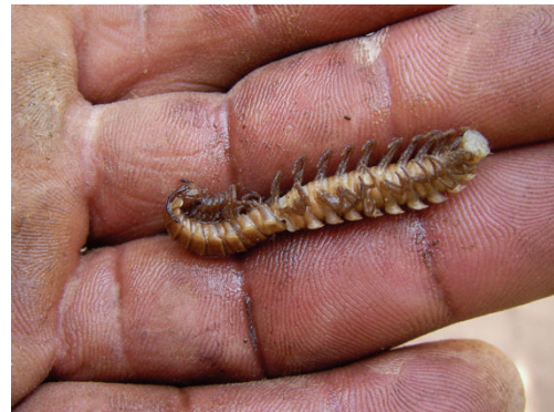
FIGURE 2: gomphodesmid millipede from Kou after boiling. S. Tchiboza phot., 2012.