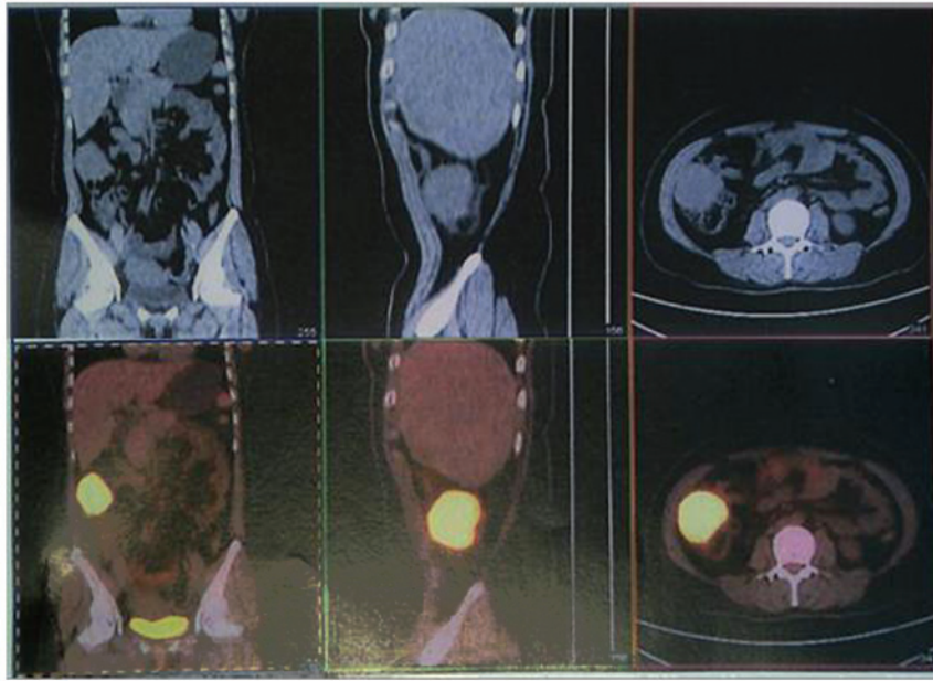
Figure 1. Positron emission tomography/computed tomography scan of the abdomen revealed a large solid mass with hypermetabolism of fluorodeoxyglucose. The mass is highlighted in yellow and was close to the liver.