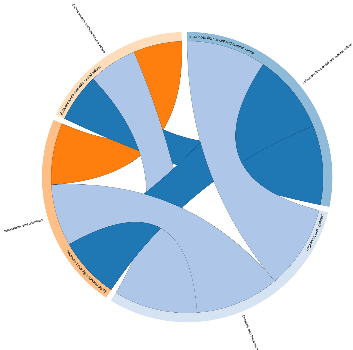
Figure 2. Chord diagram shows connections among Creativity and innovation, Influences from social and cultural values, and Motivations and values of entrepreneurs topics.

traditional values tend to be perpetuated in northern areas where these features are more deeply rooted (Le et al., 2016). The findings overall raise doubts on whether Vietnamese entrepreneurial ventures are truly creative endeavors or representative of the additivity of blind venturing efforts.