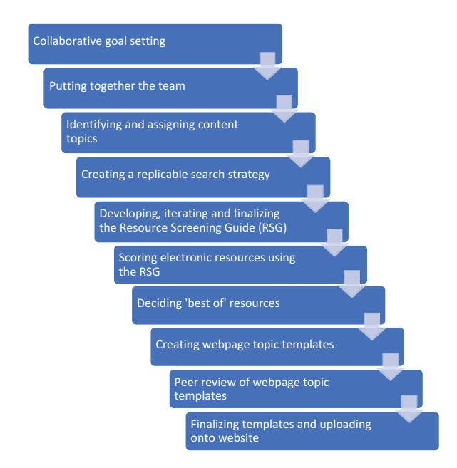
Figure 1. Overview of the process for creating the Virtual

The overall goal for the VL was to utilize a highly collaborative, participatory process [24] to systematically identify contextually and culturally relevant resources to facilitate independent clinical research in LMICs and organize them in a user-friendly, web-