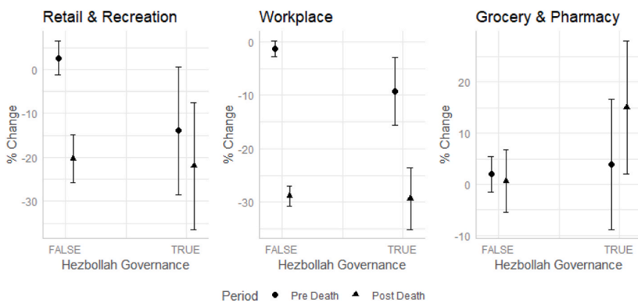
Fig. 2. Predicted changes in movement.

population may have reduced movement to grocery stores and pharmacies for some Lebanese. We speculate, and with more detail later, that Hezbollah provided basic food goods at lower prices, increasing food access to poorer Lebanese in their districts but also resulting in increased grocery and pharmacy movement in those districts.