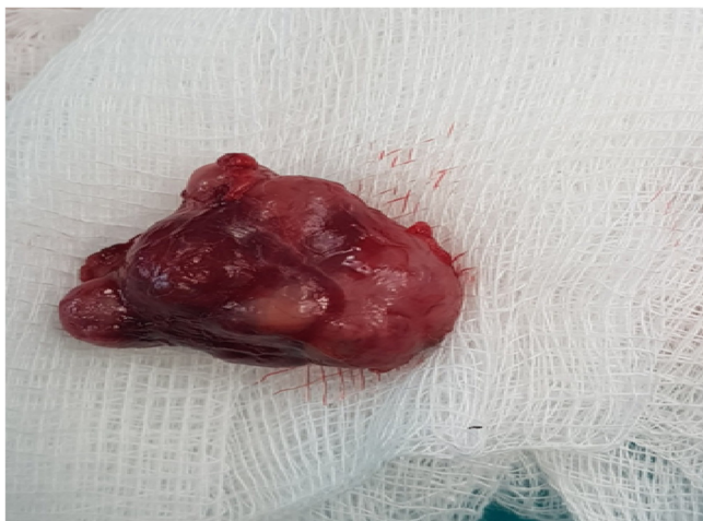
Fig. 4. The large parathyroid adenoma removed. Despite the suspicion of malignancy, histology certified the absence of mitotic and other malignant features.

since a minor accidental injury of these vessels causes a sudden massive hemorrhage [8].