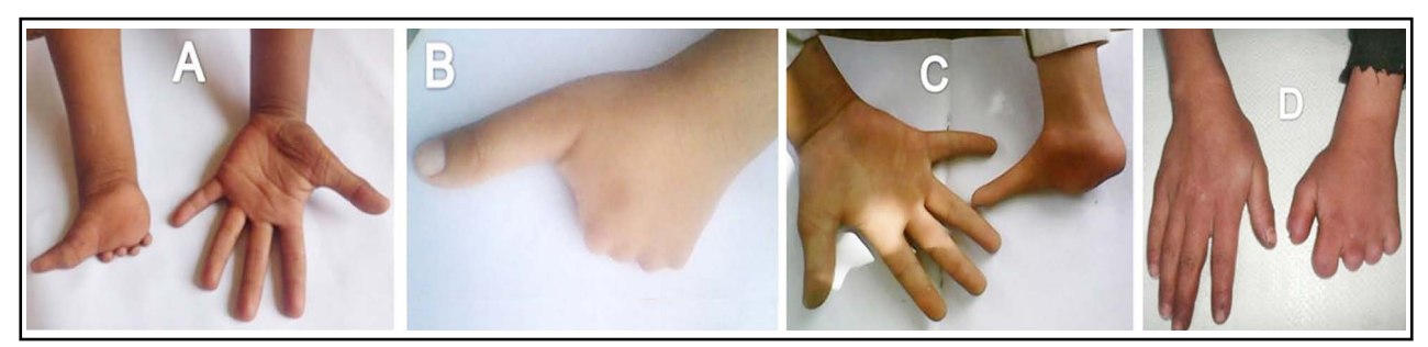
Fig.2: (A): Amputation in individual III; (B): individual IV; (C): individual V. (D); individual VI.

Case VI: The individual had CTA through the left hand (Fig.2D). Fingers 2-5 were amputated at their bases while the thumb showed terminal deficiency.