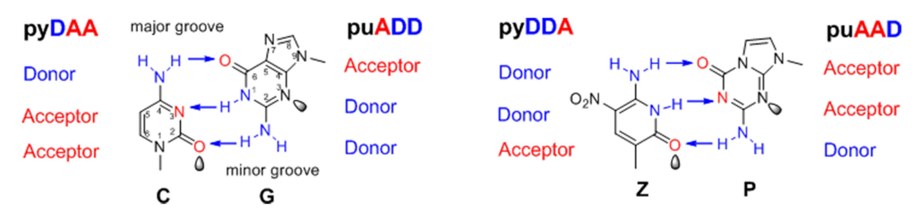
Fig 1. Structure of the natural C:G and unnatural Z:P base pairs. The natural C:G and unnatural Z:P base pairs all fit the Watson-Crick geometry, with large purines (or purine analogs, both indicated by "pu") pairing with small pyrimidines (or pyrimidine analogs, both indicated by "pu") joined by hydrogen bonds. The hydrogen-bonding donor (D) and acceptor (A) groups are listed from the major to the minor groove. The arrow indicates the hydrogen bond between the donor and acceptor. Unshared pairs of electrons (or "electron density") presented to the minor groove are shown by the shaded lobes.

Over the past decade, significant research progress has been made on Z-P UBPs in vitro [1–5]; thus, a higher research goal should be set: introduce the Z-P UBP into natural living cells. To survive in vivo , the corresponding unnatural nucleoside triphosphates must be available at sufficient concentrations within the cell for DNA replication. Nucleoside triphosphates are