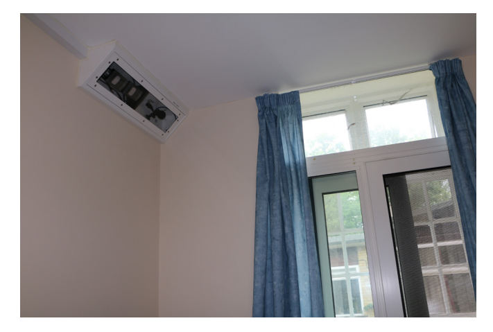
Figure 1 Digital sensor in bedroom.

The key innovation in this project is the use of Oxehealth sensors, which employ a software that uses computer vision, signal processing and AI techniques to track micromovements and colour changes (through photoplethysmography) on the body from several metres away. From these small signals, the pulse rate and breathing rate can be calculated. These techniques are akin to an automated version of the counting of chest movements commonly used in hospitals and a non-contact version of the widely used finger pulse oximeter. There is therefore no disturbance to the patient, and a breathing rate can still be calculated when the patient is fully covered by bedding. Previous studies have evaluated the technology in specific populations: renal patients undergoing dialysis,<sup>22</sup> neonates in intensive care,<sup>23</sup> adults in intensive care,<sup>24</sup> and patients and staff in a high-security mental health setting.<sup>25</sup> The British Standards Institute, acting as a notified body on behalf of the Medicines & Healthcare products Regulatory Agency, has accredited the sensors' vital signs measurement software as a class IIa medical device in Europe (figure 1). The sensors use an infrared camera, attached to a discreet wall-mounted monitor so they can function at night without having to switch lights on.