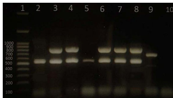
Fig. 1. Gel electrophoresis of multiplex PCR amplification products for determination of Pilus Island genes of GBS isolates. Lane 1 is DNA ladder (100 bp, Fermentas USA). PI1+PI2a (lane 3, 4, 6, 7 and 8). PI2a (Lane 2 and 5). PI2b is lane 9. Lane 10 is negative control.

The present study was implicated one of the important virulence factor, Pilus- Island and tried to determine the correlation between the identified Pilus Island and the previous serotyped GBS in our area.