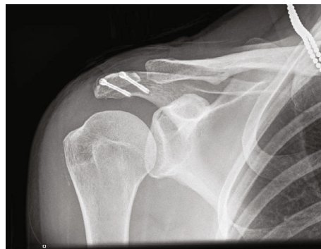
FIGURE 4: Postoperative radiograph of the final position of the screws.

sling for comfort for 4 weeks with active ROM rehabilitation started on day 1 postoperatively. At two weeks appointment, it was found that the arthroscopy wounds have healed, pain was minimal and controlled with simple analgesia when required, and patient was doing active ROM exercises. Postoperative X-ray radiographs were taken at 2 weeks follow-up (Figure 4).