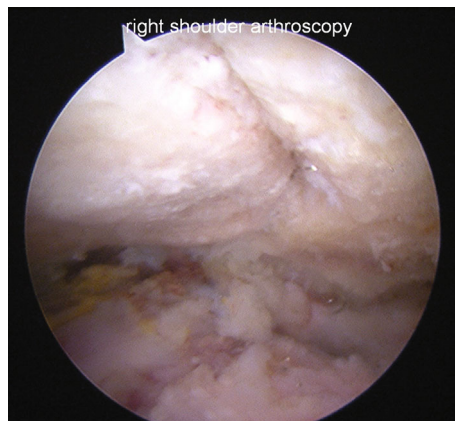
FIGURE 2: Arthroscopic image of the prepared bony surfaces prior to fixation.

The procedure was done as day case; the patient was followed up at 2 weeks and three months with parallel physiotherapy rehabilitation. The patient was given a broad-arm sling postoperatively. The patient was advised to use the