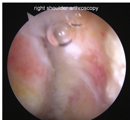
FIGURE 3: Arthroscopic image of the final position following fixation.