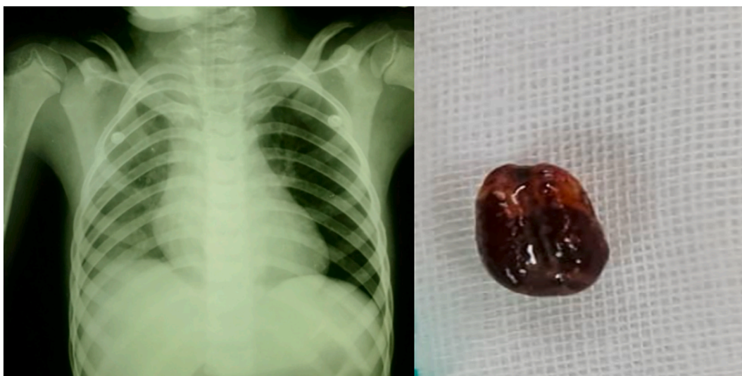
Fig. 2. Chest X-Ray of the patient after removal of the foreign body.