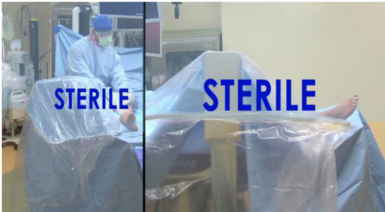
Figure 4 Five sided protection. C-armor adheres to equipment draping standards covering the x-ray tube on the top, and all four sides with a sterile barrier.