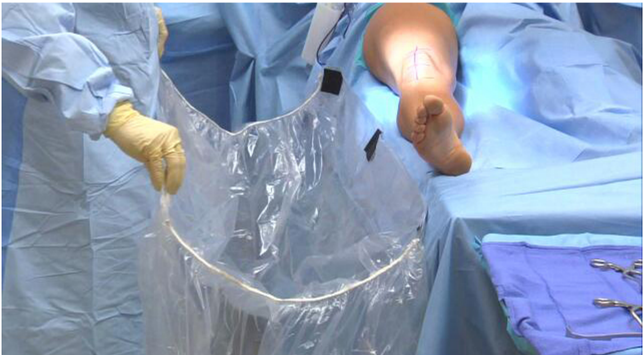
Figure 3 Expandable Collapsible Drape. The drape lies flat to the table providing unencumbered access to the surgical site, it simply manually expands with release of the fastener tabs to except the x-ray tube. The sterile pouch lies adjacent to the patient. The pouch is radiolucent allowing improved fluoroscopy targeting. The pouch also protects the x-ray tube from biohazard fluids.