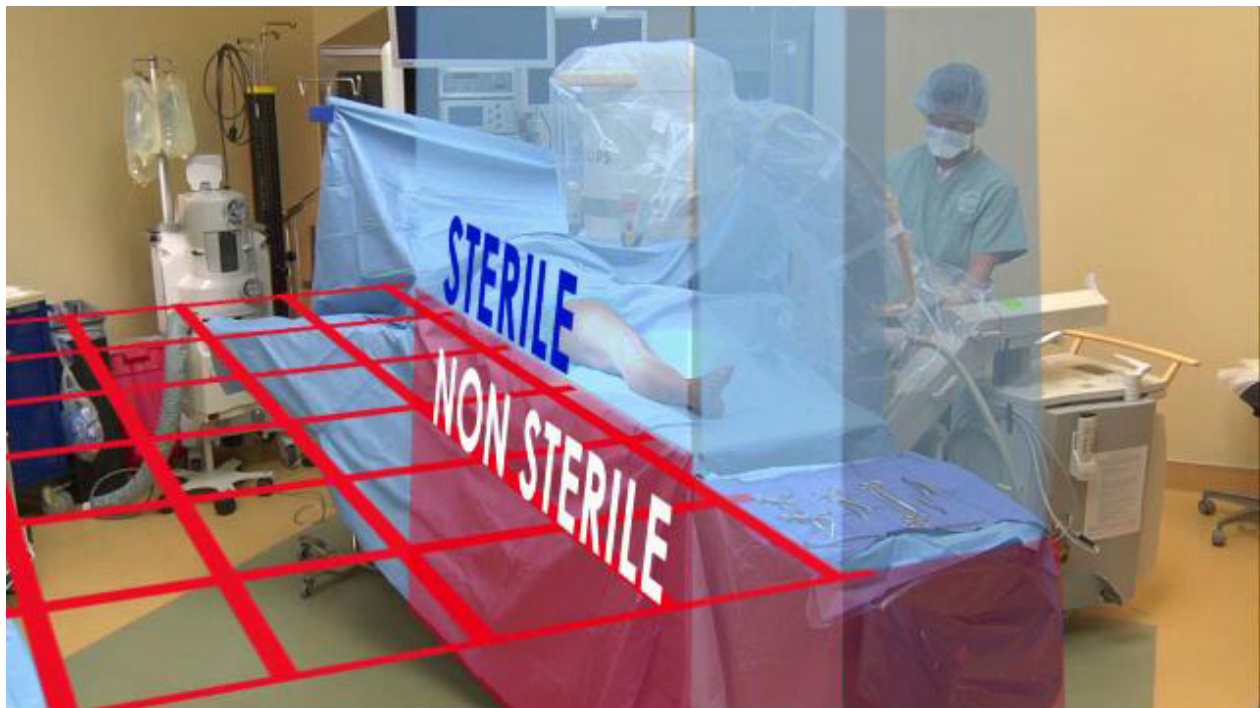
Figure 2 Sterile Field. The sterile field is defined as the horizontal plane level with the surgical tabletop as depicted by the red grid.

hazardous radiation exposure. The sterile pouch may also be used to house instruments such as the Bovie or suction tubing during the operation. The drape often further protects the sterile field by catching dropped instruments. C-armor also protects the x-ray tube from biohazard fluids. Irrigation and body fluids can not only damage the equipment but also create a means for cross-contamination from one patient to another.