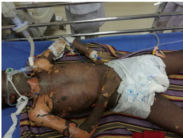
Figure 1 Image showing the patient incubated with evidence of extensive involvement of the skin of neck and limbs.

He had multiple ruptured bullae all over the body and erythematous skin. Oral and conjunctival mucosae were also involved (Figure 2). Dermatology opinion was sought. More than 30% of the body surface area was involved. Provisional diagnosis of SJS was made. Investigations revealed elevation in cardiac biomarkers. Echocardiogram revealed global hypokinesia. Prothrombin time was 15 s. Activated partial thromboplastin time was 32 s. Platelet count was 143,000 L/mm 3 . Results of liver function tests were normal.