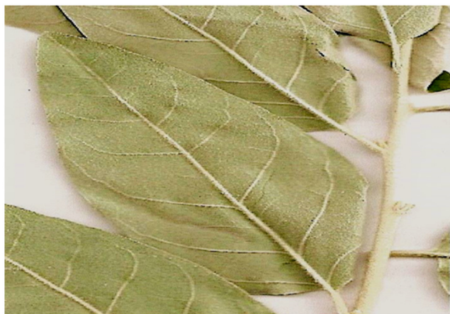
Figure 1 Uncinula sp. found on leaves of Elaeagnus oxycarpa Schlecht.