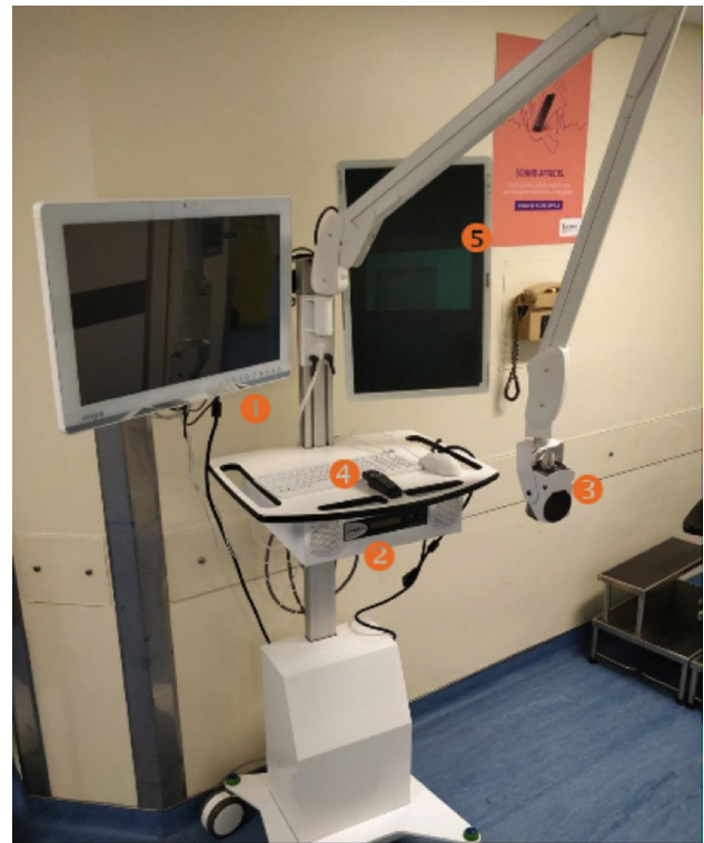
Fig. 1 Proximie platform. 1. Main computer system 2. Audio/Video System 3. Camera with optical zoom 4. Remote Control 5. Secondary screen

Baseline demographics, comorbidities, basic metabolic serum markers, and BPO specific variables such as prostate size and preoperative prostate-specific antigen (PSA) serum levels were compared between onsite mentored and telemetry-assisted procedures. The type of anesthesia used (general versus spinal anesthesia) and whether selective cautery was used at the bladder neck for hemostasis were included. To evaluate for the effect of telementoring on the surgical outcomes, the operative time (minutes), length of hospital stay (days), time to foley removal (hours), haemoglobin drop (g/dL), percent (%) drop in PSA, the rate of urinary retention, and 30-day adverse event were compared between the two groups. The 3-month functional outcomes were also examined including drop in American Urological Association's international prostate symptom score (IPSS), quality of life assessed by a single question, and post-void residue (PVR).