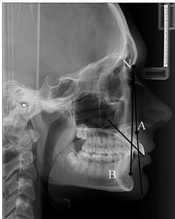
Figure 1. The cephalometric ANB angle and the angle of inclination of upper incisors.

The first patient group consisted of 30 patients (18 women; 12 men) with an orthognathic jaw relationship (Class I) and