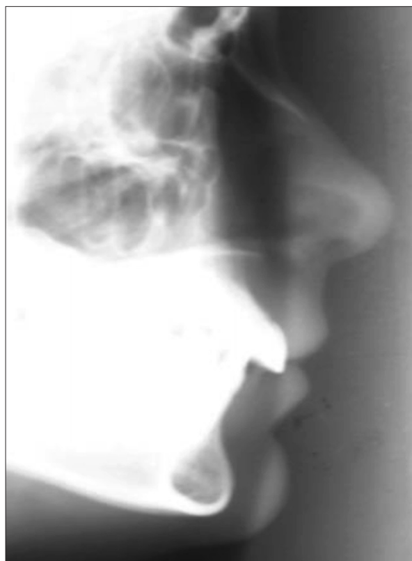
Figure 3. A female patient with a thinner upper lip and thicker soft tissues of the lower lip, mentolabial sulcus and chin, which have a compensatory effect on the appearance of the profile with a distal jaw relationship and protrusion of the upper incisors.

Kamalpreet et al. established the differences between men and women in FSTT in patients from northeast India using CT scanning and MRI [18]. Aggarwal and Singla reported on the presence of significant differences between men and women, and men had increased values for FSTT for the labrale superius, labrale inferius, pogonion and menton, compared with women, and recommended that this difference should be taken into consideration when planning orthodontic therapy [30]. Hamid and Abuaffan [4], Ramesh et al. [5], Chen et al. [22], Atashi et al. [38], and Masoumeet et al. [17] have all shown differences in FSTT between men and women, but have given the explanation as being due to the influence of body mass index (BMI). Karnaket et al. [27], and Maurya et al. [39] found significant differences between men and women in the area of the labrale superius and pogonion. Panenkova [2], Subramanian et al. [10], Celikoglu et al. [28], and Al-Mashhadany et al., in patients with a Class I sagittal relationship [31], showed significant differences between men and women for the FSTT of the labrale superius, labrale inferius and pogonion, and came to similar conclusions as the present study. However, in contrast to the findings of the present study, Drgacova et al. [20],