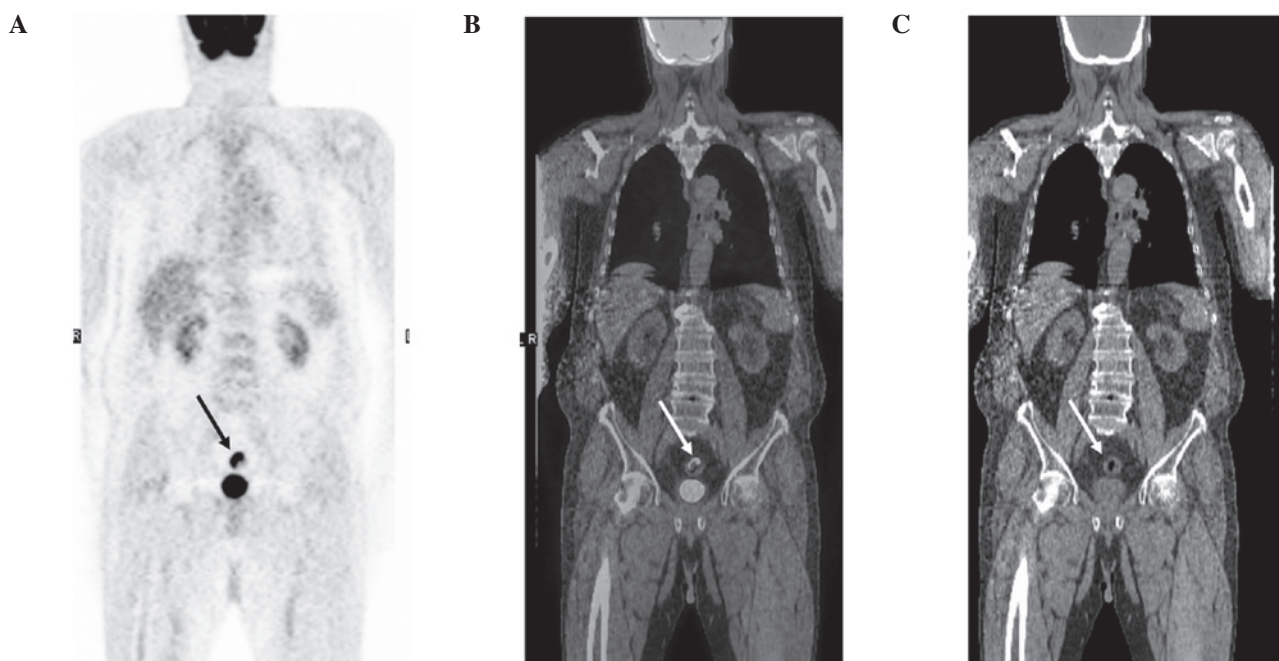
Figure 2. A 79-year-old male was referred for the assessment of a pulmonary nodule observed on CT. (A) Coronal FDG-PET, (B) PET/CT and (C) CT slices demonstrate intense FDG uptake in the proximal region of the colon (arrows). On colonoscopy, a large ulcer was found in 15 cm into the colon. The final diagnosis was of an adenocarcinoma of the colon. FDG PET/CT, fluorodeoxyglucose positron emission tomography/computed tomography.

16 patients; however, all the patients had undergone surgical resection of their primary lesions and had no evidence of disease located in the bowel. Moreover, the medical files of patients who underwent a colonoscopy due to colonic observations on FDG PET/CT were reviewed, therefore, the rates of incidental colonic observations or the false negative rates were not evaluated. The true positive rates (36%) in the current study were lower than reported by others. Despite possible false-positive results, colonoscopy is recommended as the next diagnostic step for further evaluation of such observations. Since there are numerous confounding factors when evaluating the colorectal region, including fecal impaction, muscular peristaltic activity and inflammation, re-evaluation of the scan is advised. Gutman et al (6) indicated that in 3 patients, re-evaluation led to a different conclusion from that of the scan report regarding the nature of the FDG focal colonic uptake. The re-evaluation indicated that the colonic lesion was consistent with physiological activity, as the FDG uptake was located in the colonic lumen without bowel-wall involvement in an area of fecal stasis.