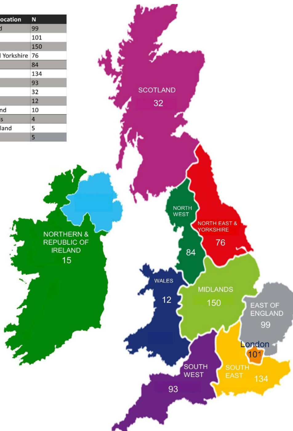
Figure 1 Geographical location.

additional ethical and privacy considerations of online and remote work.