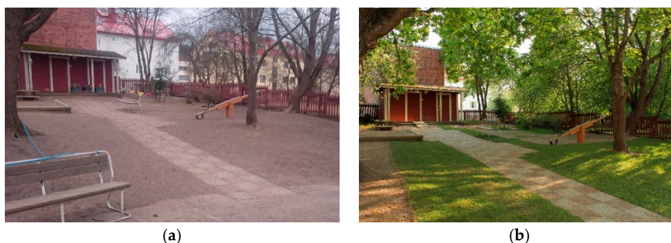
Figure 1. (a) Before the intervention, the daycare yards were mostly covered by mineral soil materials; (b) After the intervention, the daycare yards were covered by forest floor mat and sod.

We analyzed how green yards with diverse vegetation and high microbial load encourages children's engagement with their everyday life-worlds and enhance well-being in daycare centers that are located in urban areas in southern Finland. The yards were transformed by replacing areas covered by mineral soil materials, such as gravel, with forest floor (around 100 m 2 per yard, provider Piiraisen Kuntta Oy, Kajaani, Finland), sod (around 200 m 2 per yard, provider Mesiän Siirtonurmi, Hämeenkoski, Finland), peat blocks (provider Kekkilä Oy, Vantaa, Finland), and planters for vegetable and flower growing (Figure 1). Due to the transferability of the materials, it took only one night to green the yards. The materials were easy to find and relatively inexpensive. The personnel introduced the green materials into the children's various activities with the help of tips from an environmental educator (including a written description of 13 nature-based activities, several crafting ideas, and links for further information). The children also used the yard freely when they spent time outdoors every day (0.5–2 h in the morning and in the afternoon).