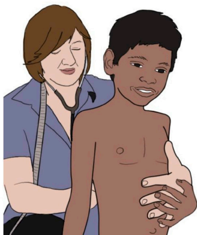
Figure 5 Cartoon version of photograph on the pictorial flip chart as example of alternative media consent.