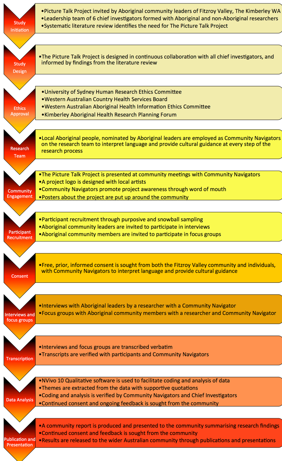
Figure 1 The Picture Talk Project Protocol.