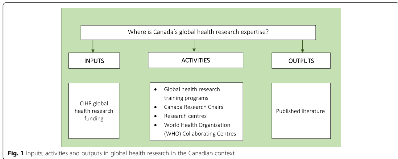
Fig. 1 Inputs, activities and outputs in global health research in the Canadian context

additional supplementary search whereby we sought out the 'Research' tab in the site navigation area of each university's website. This tab led to webpages that listed all research centres hosted by the university. We reviewed the lists available on these web pages to identify centres that conducted global health research. WHO Collaborating Centres are institutions or groups that conduct activities in support of WHO's various initiatives [18]. Designated by WHO's Director-General, Collaborating Centres can often partake in activities like research, training and education, advising WHO staff on specific topics, and collecting and collating information and resources [18]. We searched the WHO Collaborating Centres Database for information on the title of the centre, the designated parent institution (i.e. usually a university), the subjects of focus and the types of activities conducted [18, 19]. This information allowed us to understand which Canadian universities were involved and in what capacity, including which subject areas and what types of activities.