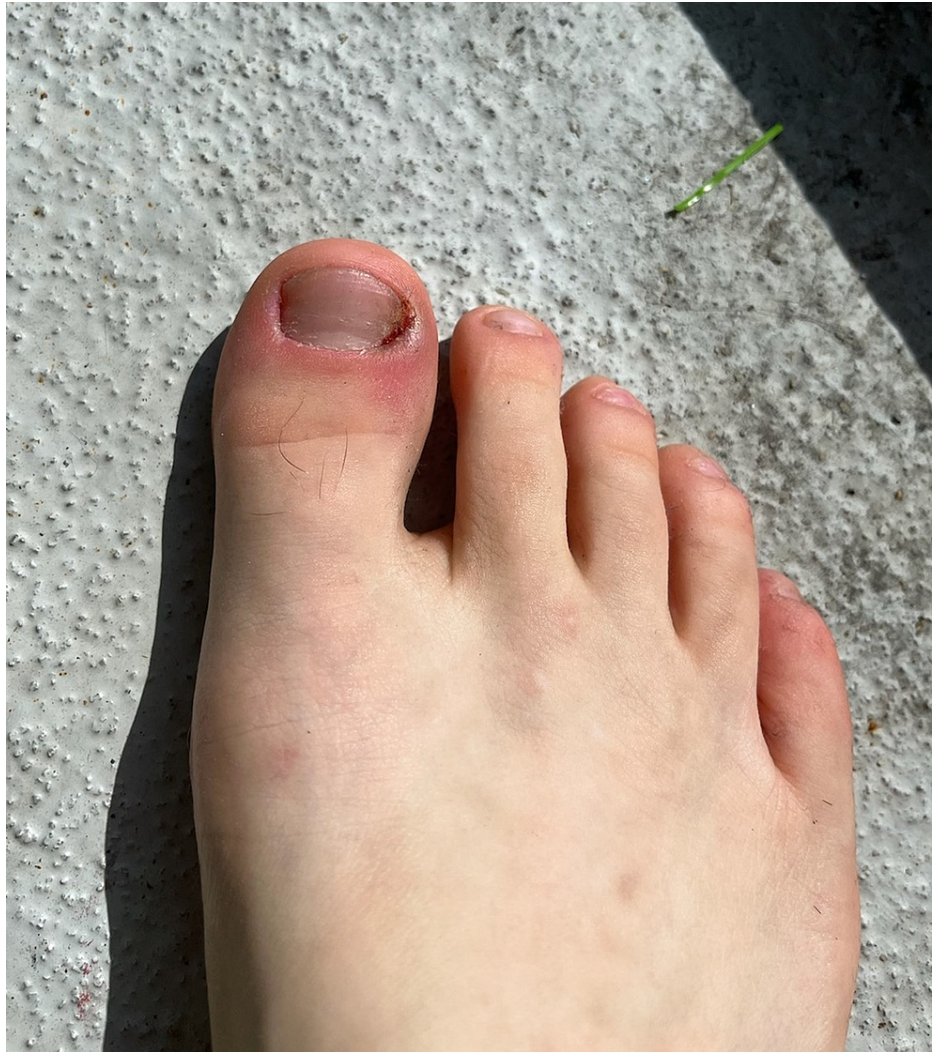
FIGURE 5: Four-week survey of the right foot. Paronychia is still noted on the lateral border of the first toenail. A slight improvement was noted in the overall nail length and extent of damage, particularly on the medial side of the first toenail.

He was further given addiction management and psychiatric resources, as well as more topical antibiotics in the case of any digital infection. Additionally, he was connected to counseling and therapy resources specifically geared toward lower-income and unsheltered patients.