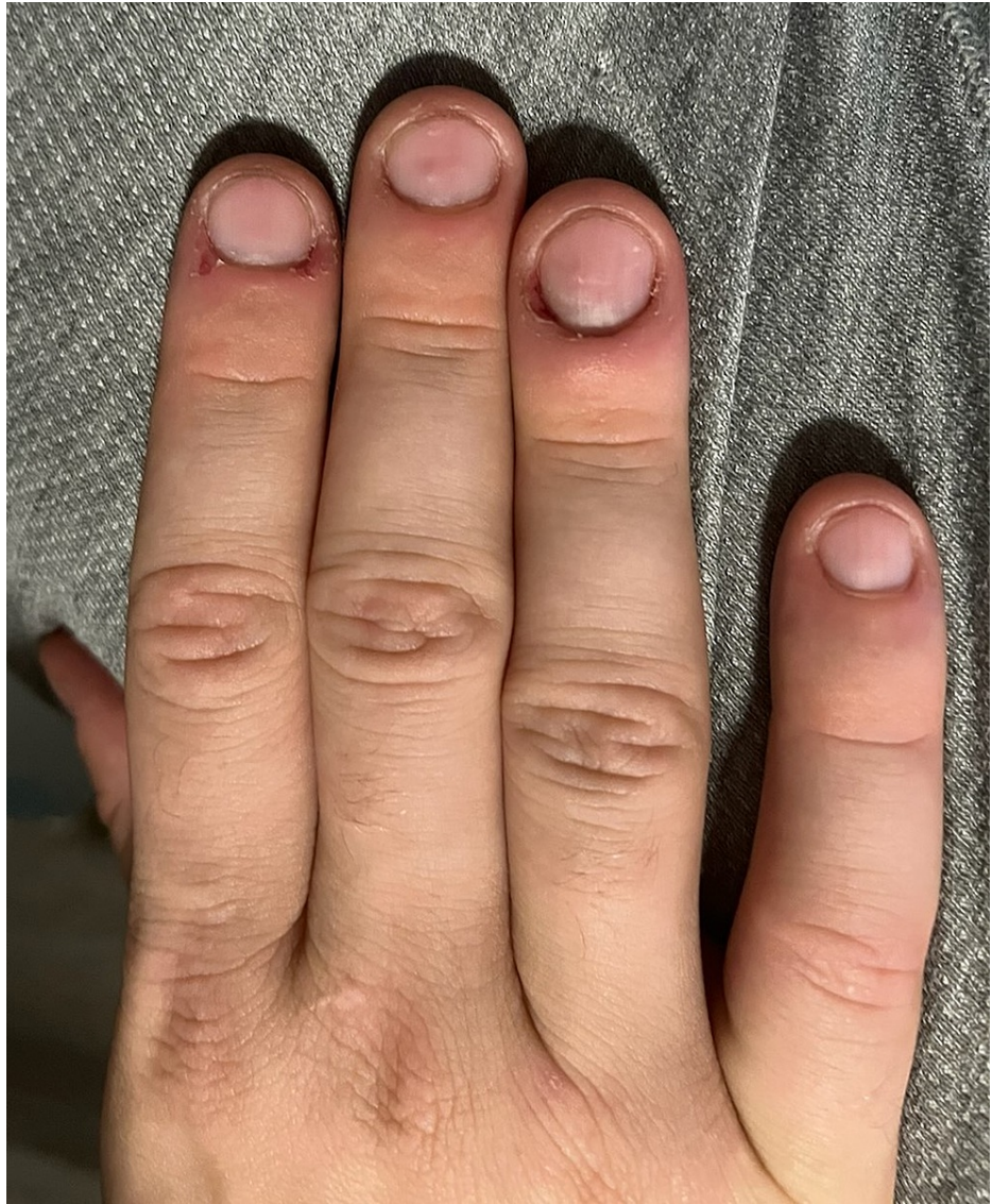
FIGURE 4: Four-week follow-up of the right hand. A slight improvement was noted in the periungual skin on the third and fourth digits, but no significant changes overall.

His foot did show a partial resolution of the infection, as well as medial nail growth (Figure 5). However, he continued to endorse a constant feeling of needing to pick and shape his nails.