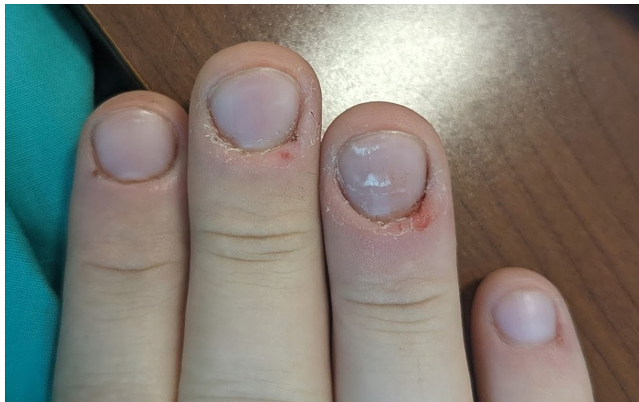
FIGURE 1: Initial photo of the right hand. There is a demonstrable partial loss of nails with trauma to the periungual areas, particularly on the fourth digit.

Upon initial survey, his right hand was noted to have nail shortening on all digits (Figure 1), and the patient endorsed having frequent infections around the nail beds of most of his fingers. In those cases, he described the pain as so severe that the use of his hands and feet would be limited. He later endorsed regular usage of methamphetamine. The patient reported continued onychotillomania during periods of sobriety, but when using, the behaviors worsened to also pick at his face, arms, and upper back. His right foot was also noted to have considerable damage and paronychia (Figure 2).