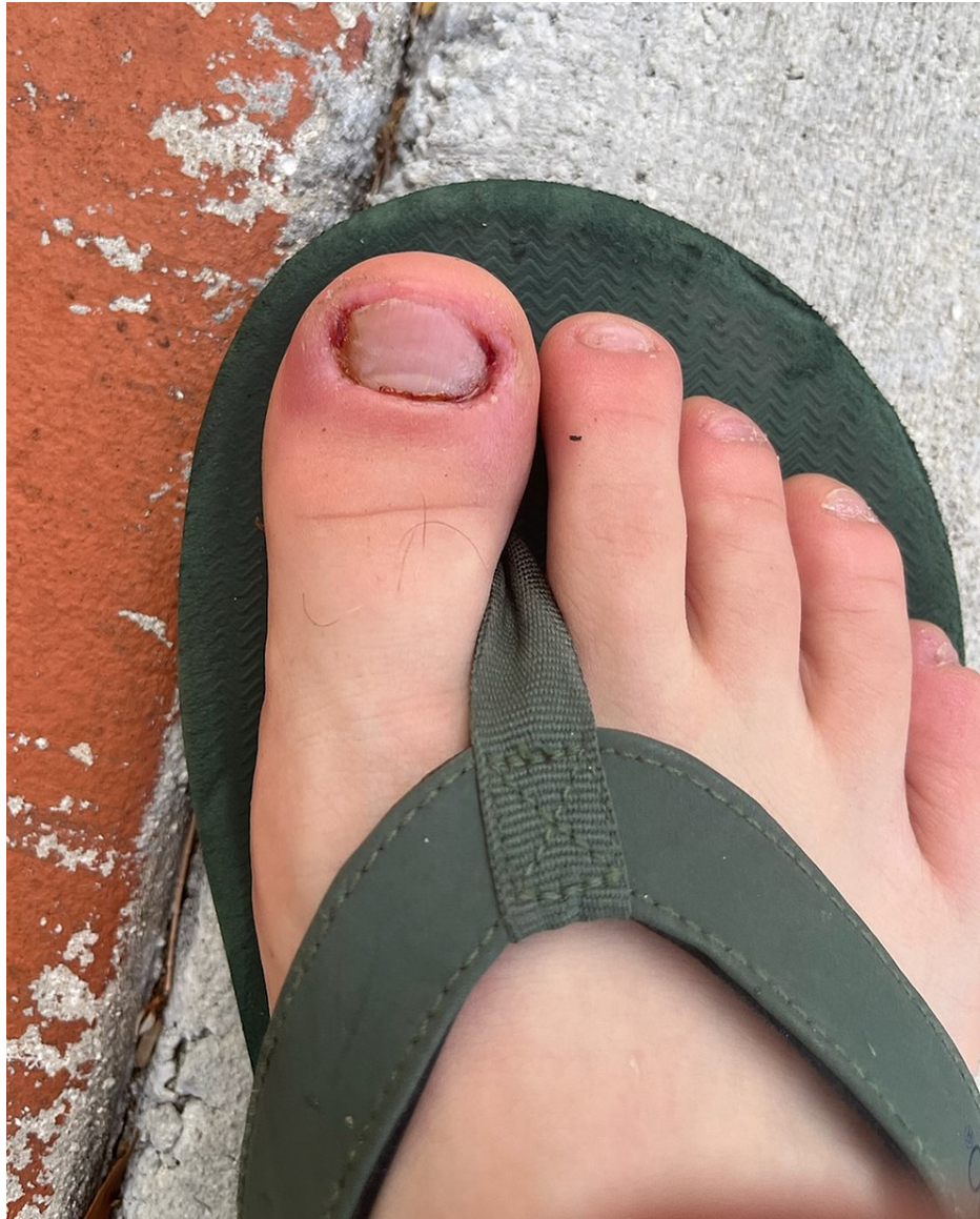
FIGURE 2: Initial survey of the right foot. Acute paronychia was noted on the hallux. All nails were significantly shortened with some dystrophic changes noted on the fifth toenail.

His excoriation behavior was described by him as one of the many things in his life that he could not control. He also endorsed feeling a need to achieve perfection around the nail edges, thereby continuously “shaping” and altering the nail. Picking was not the only mechanism used; he collected multiple tools such as a nail file, tweezers, and a nail cutter in order to pick, pull, and cut the nails. He also kept topical antibiotic ointment (polymyxin, bacitracin, and neomycin) and applied it to the instruments and his fingers after causing excessive skin trauma (Figure 3).