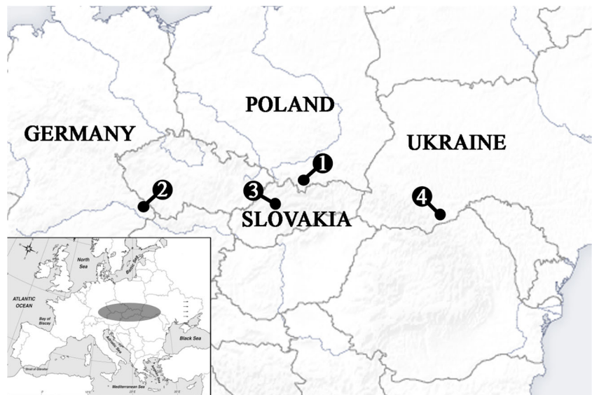
Fig. 1 Sampling locations of European huchen: 1. Restocking Centre and Trout Hatchery Lopuszna, Poland; 2. Fish farm Lindbergmuehle, Bavaria, Germany; 3. Fish farm Pribovce, Martin Province, Slovakia; 4. Fish farm “Ishkhan” Baniliv, Chernivtsi Province, Ukraine

annealing at 53–61 °C (Table 1) for 45 s, elongation at 72 °C for 45 s and a final elongation step at 72 °C for 7 to 10 min.