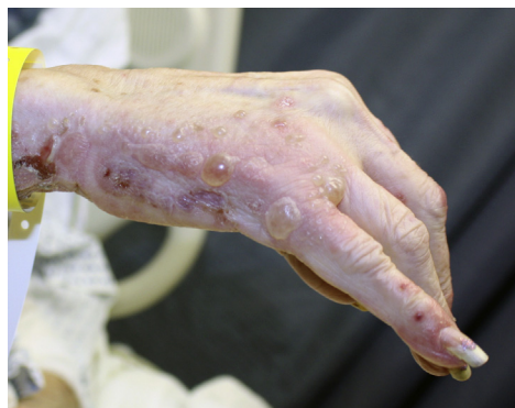
Fig 2. Bullous pemphigoid. Representative clinical image from the right hand.

was selected as a steroid-sparing agent given her elevated IgE level. The omalizumab was dosed using the asthma nomogram. 1 Treatment with omalizumab allowed for complete discontinuation of oral prednisone while maintaining disease control. The nivolumab therapy was restarted.