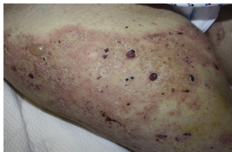
Fig 1. Bullous pemphigoid. Representative clinical image from the right thigh.