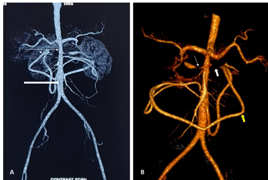
FIGURE 2: CECT arterial-phase image. (A) Significant luminal narrowing of the distal descending thoracic aorta (thin white arrow) with poststenotic dilatation (thick white arrow). (B) Three-dimensional volume-rendered image showing grossly stenosed right renal artery (thin white arrow) with poststenotic dilatation. The proximal left renal artery is not visualized (thick white arrow) due to severe narrowing. The inferior mesenteric artery is hypertrophied (yellow arrow) and anastomosing with the branches of the superior mesenteric artery.

CT angiography of bilateral renal vessels revealed concentric circumferential wall thickening of the distal descending thoracic aorta (Figure 1B) and bilateral proximal renal artery stenosis (Figure 1C). The descending thoracic aorta was stenosed over a length of 13 cm with significant luminal narrowing (Figure 2A), as well as the presence of poststenotic dilatation in the aorta and the right renal artery (Figure 2B).