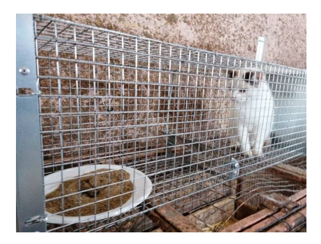
Figure 1. Confinement of a cat by using a trap cage.