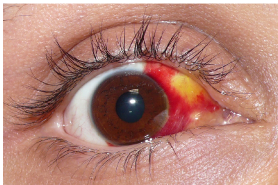
Figure 4 An island of yellow discoloration on the nasal part of the bulbar conjunctiva indicating absorption of the subconjunctival hemorrhage.

There is not any approved treatment to accelerate the resolution and absorption of SCH. The first treatment reported in the literature was air therapy. 74 A patient with a severe SCH caused by acute hemorrhagic conjunctivitis was treated