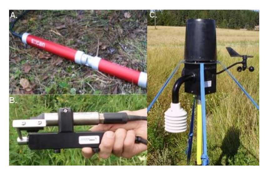
Figure 2. Photographs of the devices used in SoilWeather WSN: ( A ) the spectrometer used in measuring water turbidity and nitrate concentration; ( B ) Turbidity sensor; and ( C ) weather station (Photographs: Lippo Sundberg, MTT Agrifood Research Finland).

To demonstrate the usability of local sensor measurement in agricultural decision support, we carried out a plant protection forecast pilot for potato blight, white mould of turnip seeds and three leaf blotch diseases (glume blotch and tanspot for wheat and net blotch for barley). In potato blight application, timing of the spraying operation was supported by estimates for onset and spreading of potato blight. We employed the complex LB2004 model at Web-blight warning service (www.euroblight.net) [118,119] in which an interface was built to operate with SoilWeather sensor data (air temperature and humidity). Additionally, potato blight risk was assessed by a simple model that uses only temperature and relative humidity measured locally in farms. This model was tested for 11 potato fields in SoilWeather WSN. The prevention need for white mould of turnip seeds was estimated by a simple decision rule: if the soil is continuously moist (precipitation is ~30 mm) in three week time period before the flowering of turnip seed, prevention against white mould is needed [117].