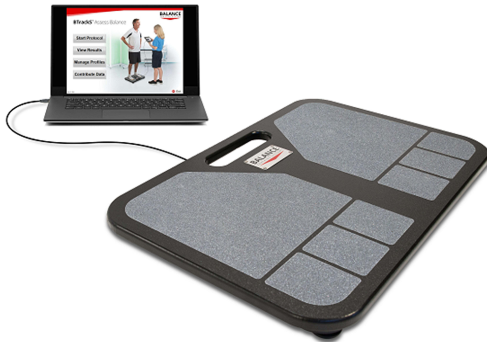
Figure 1 Experimental equipment used in this study included the BTrackS Balance Plate (right) and BTrackS Assess Balance software running on a laptop (left).

COP data have found it to be ecologically valid, highly accurate, and precise. 10–13 For some conditions in this study, participants were also asked to stand on a lightweight, high-density foam cushion provided with the BTrackS Balance Plate and software. The top surface of the foam cushion was 0.5×0.4 m and the height was 6 cm.