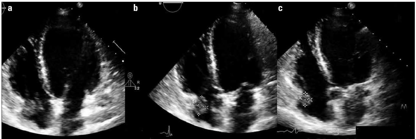
Figure 2. a-c. (a) Transthoracic echocardiography reveals an embolized TVAD from the right atrium into the right ventricle and a nodular mass in the right atrium. (b) Diameter of the nodular mass is measured to be 1.4×1.7 cm before the antibiotics therapy. (c) Diameter of the nodular mass reduced to 1.0×1.3 cm 10 days after the antibiotics therapy and retrieval of embolized TVAD

Video 1. Fluoroscopy showed a TVAD, which was fractured, and approximately 20 cm of it was embolized from the right atrium to the pulmonary artery