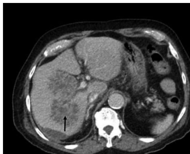
Figure 1. A computed tomography scan of the abdomen demonstrating multiloculated liver abscesses (arrow).

K. pneumoniae is a gram-negative bacillus that belongs to the order Enterobacterales and the family Enterobacteriaceae [3]. This pathogen is commonly implicated as a cause of nosocomial infections [3, 4]. Hypervirulent K. pneumoniae isolates