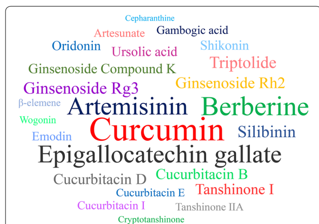
Fig. 1 The anti-cancer compounds from Chinese herbal medicine (CHM). The popular anti-cancer compounds in CHM presented as a “word cloud”, in which the size of each name is proportional to the number of publications of the compounds

Different natural products derived from Chinese herbal medicine, including curcumin, EGCG, berberine, artemisinins, ginsenosides, ursolic acid (UA), silibinin, emodin, triptolide, cucurbitacins, tanshinones, ordonin, shikonin, gambogic acid (GA), artesunate, wogonin, \beta -elemene, and cepharanthine, were identified with emerging anti-cancer activities, such as anti-proliferative, pro-apoptotic, anti-metastatic, anti-angiogenic effects, as well as autophagy regulation, multidrug resistance reversal, immunity balance, and chemotherapy improvement in vitro and in vivo. These compounds are considered popular with over 100 supported publications and are selected to be discussed in more details. Figure 1 shows the word cloud of these compounds. In this review, the advantages and drawbacks of representative Chinese herbal medicine-derived compounds in different types of cancers were also highlighted and summarized.