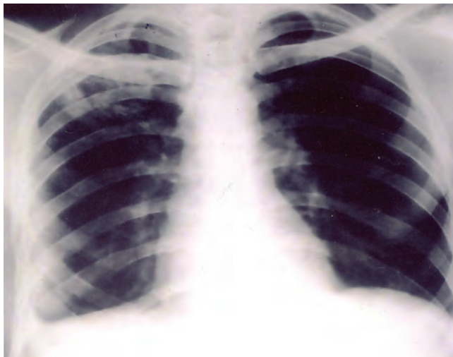
Fig. 1 : Xray chest PA view showing heterogeneous opacity in the right upper zone with blunting of the right costophrenic angle.

no abnormality. Examination of the chest revealed crepitations in the right infra-clavicular area and signs of right-sided pleural effusion. Chest radiograph showed a heterogeneous opacity in the right upper zones with blunting of the right costophrenic angle (fig.1). Sputum examination was positive for acid-fast bacilli. Pleural fluid revealed straw colored exudative effusion with a predominance of lymphocytes. Patient was put on Category 1 treatment for tuberculosis as per Revised National Tuberculosis Control Programme (RNTCP) guidelines. After eight days of start of therapy, the patient presented with sudden onset of pain on the left side of chest and dyspnoea. Chest radiograph revealed a pleural effusion on the left side (fig.2).