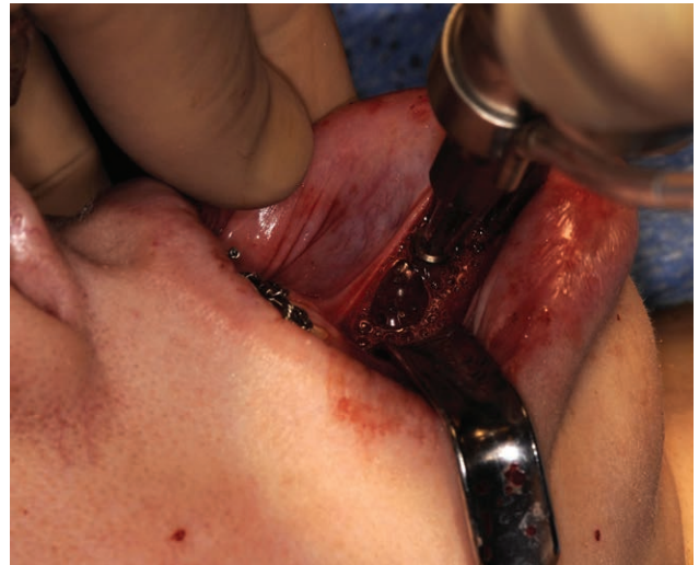
Fig. 3. After marking of the midline of the chin, the osteotomy is made with a reciprocating saw according to a groove made with a small Lindemann drill.

quirements. There are no chin wing osteotomies performed with this technique. On the other hand, transverse osteotomy (midline), impaction, and small leveling of the chin were possible to be achieved. The actual osteotomy is made with a reciprocating saw and finalized, if necessary, with a chisel. The soft-tissue lingual to the osteotomy line is probably less damaged due to a more tangential positioning of the saw. The mobility of the chin segment is checked and positioned according to the functional requirements, esthetic preferences, and physiologic possibilities. An 8mm self-taping screw is placed in the middle of the chin segment while a 0.4 metal ligature is attached and used to stabilize the segment during final fixation. Fixation of the genial segment is performed with a KLS-MARTIN 2.0mm Arnett FAB System chin plate and 4x6mm self-taping screws. Subsequently, the 8mm screw and ligature are removed (Fig. 4). After intraoperative evaluation of the chin shape, the wound is closed in 2 layers.