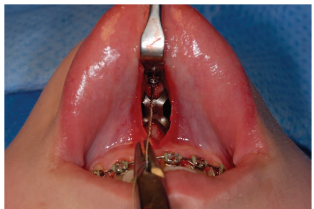
Fig. 4. An 8mm self-taping screw is placed in the middle of the chin segment while a 0.4 metal ligature is attached and used to stabilize the segment during final fixation. Fixation of the genial segment performed with a KLS-MARTIN 2.0mm Arnett FAB System chin plate and 4x6mm self-taping screws. The 8mm screw and ligature are removed after fixation.

quirements. There are no chin wing osteotomies performed with this technique. On the other hand, transverse osteotomy (midline), impaction, and small leveling of the chin were possible to be achieved. The actual osteotomy is made with a reciprocating saw and finalized, if necessary, with a chisel. The soft-tissue lingual to the osteotomy line is probably less damaged due to a more tangential positioning of the saw. The mobility of the chin segment is checked and positioned according to the functional requirements, esthetic preferences, and physiologic possibilities. An 8mm self-taping screw is placed in the middle of the chin segment while a 0.4 metal ligature is attached and used to stabilize the segment during final fixation. Fixation of the genial segment is performed with a KLS-MARTIN 2.0mm Arnett FAB System chin plate and 4x6mm self-taping screws. Subsequently, the 8mm screw and ligature are removed (Fig. 4). After intraoperative evaluation of the chin shape, the wound is closed in 2 layers.