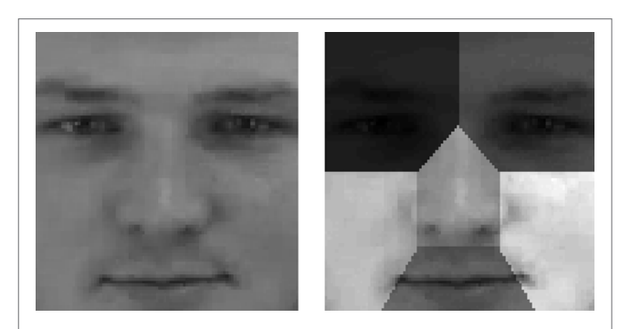
FIGURE 2 | (Left) Normalized face. (Right) The face divided to six parts: left and right eye, left and right cheek, mouth and nose. The person in the figure is not related to the study.

In order to measure the predictive power of each one of the three types of vectors (and two combinations thereof), we employ a logistic regression analysis. This is done separately for each rater and to each vector type (the five types described in Sec. 2.4.1) and is repeated to each domain: quality, range, and subtype of affect. Each separate analysis (a total of 5 types of vectors, including the 2 hybrid types, times 5 raters, times 3 domains, or a total of 75 experiments) employs the classes of the domain