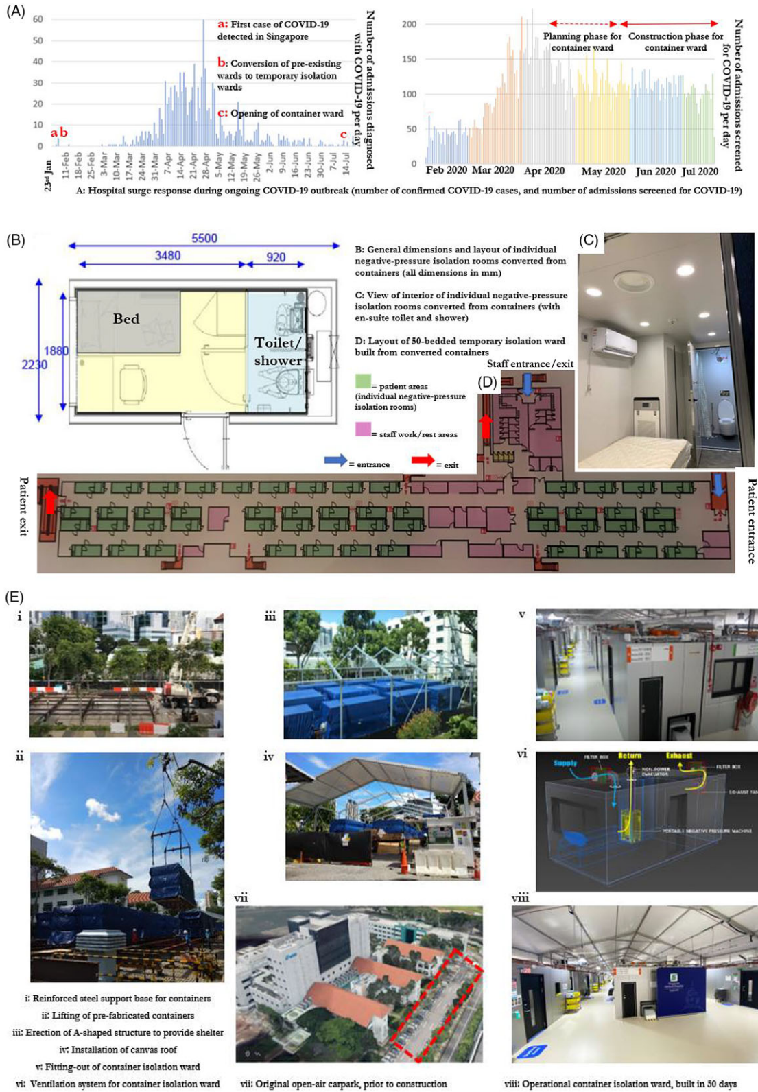
Fig. 1. Hospital surge response over 6 months during COVID-19 outbreak, layout of container isolation ward, and construction process.

over 1 month of operations, despite regular audit. Overall, >1,500 cases of COVID-19 have been managed at our institution.