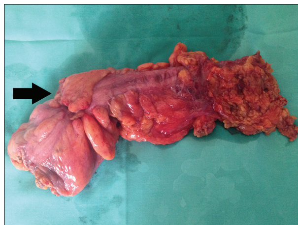
Figure 3: The tumor in the resected specimen of the sigmoid colon (arrow)

Signs and symptoms may be limited to the already commonly reported signs for the inguinal hernia. Patients with history of intra-abdominal malignancy presented with a new inguinal hernia should always be investigated for a possible recurrence. Additional findings such as loss of weight, changes in bowel habits and defecation, bleeding or anemia not otherwise attributed, and the contemporaneous presence of inguinal hernia should raise the suspicion of a herniated colonic neoplasm. [2] According the question whether patients who present with inguinal hernias should have colon imaging as part of their initial workup, we